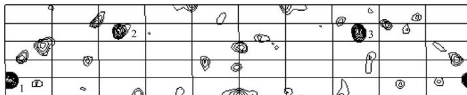
Figure 2 \nu = 0.5 Harker section of the anomalous Patterson computed between 10 and 2.6 Å using the Ba 2+ crystal data. The map is contoured from 1.5 \sigma in 0.5 \sigma intervals. Main peaks, labelled 1 (6.6 \sigma ), 2 (4.7 \sigma ) and 3 (5.3 \sigma ), are the self-peaks corresponding to the three Ba atoms.